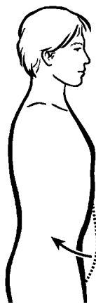
Fig. 1 Abdominal hollowing.

Finally, you should be able to draw your navel to your spine and raise your pelvic floor up without breathing in against the resistance of your closed nostrils. Also, notice if you are squeezing your buttock muscles at all. The exercise is performed correctly when your buttocks muscles are relaxed. This exercise should be performed many times a day in a variety of positions. It should also be performed when you feel you need to brace your lower back because of a threatening situation (e.g. lifting or carrying).